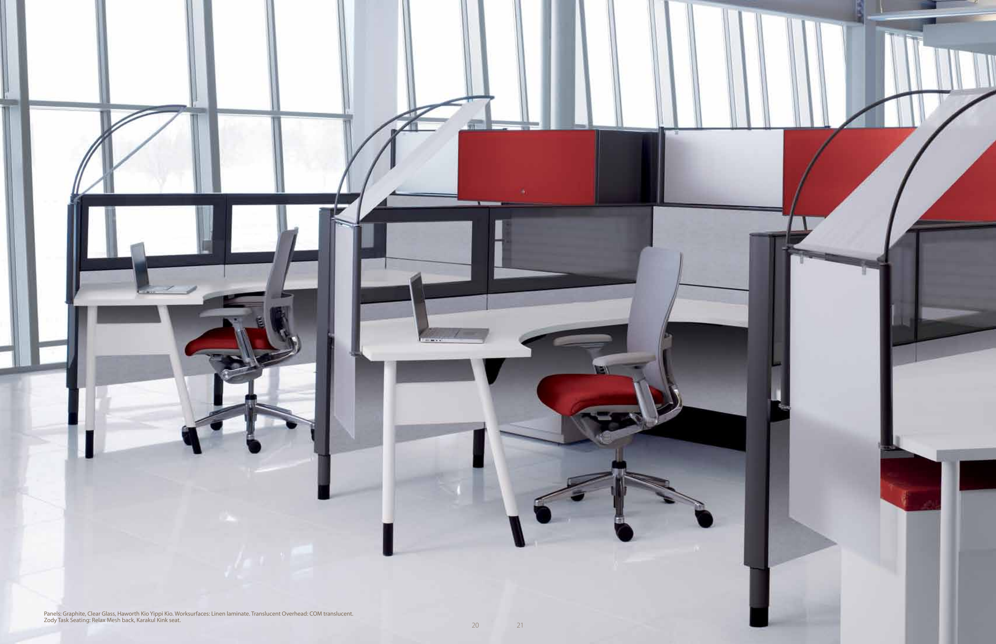
Panels: Graphite, Clear Glass, Haworth Kio Yippi Kio. Worksurfaces: Linen laminate. Translucent Overhead: COM translucent. Zody Task Seating: Relax Mesh back, Karakul Kink seat.