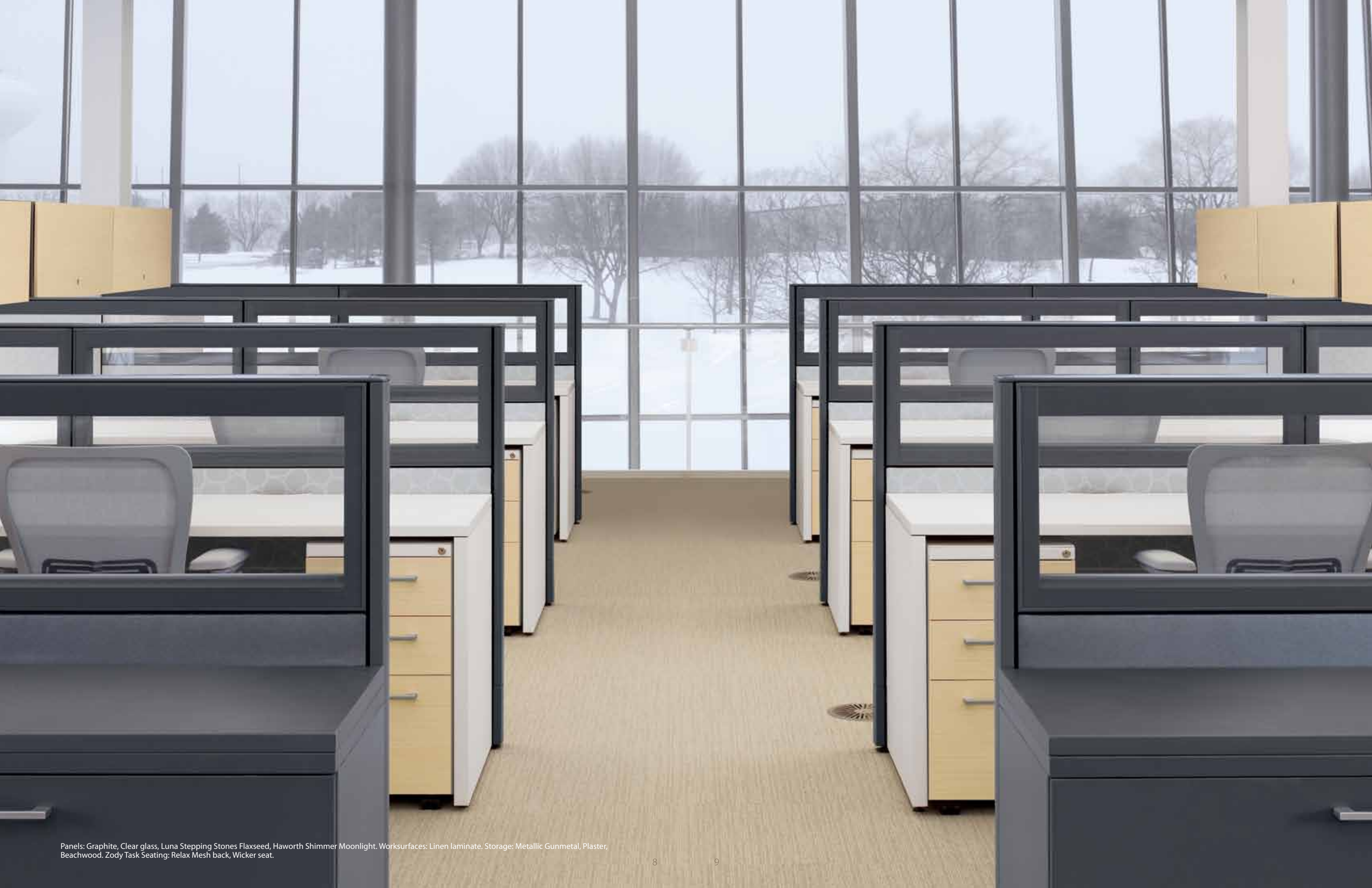
Panels: Graphite, Clear glass, Luna Stepping Stones Flaxseed, Haworth Shimmer Moonlight. Worksurfaces: Linen laminate. Storage: Metallic Gunmetal, Plaster, Beachwood. Zody Task Seating: Relax Mesh back, Wicker seat.