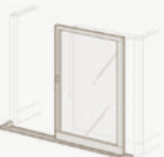
Sliding Door Finishes: clear glass, frosted acrylic