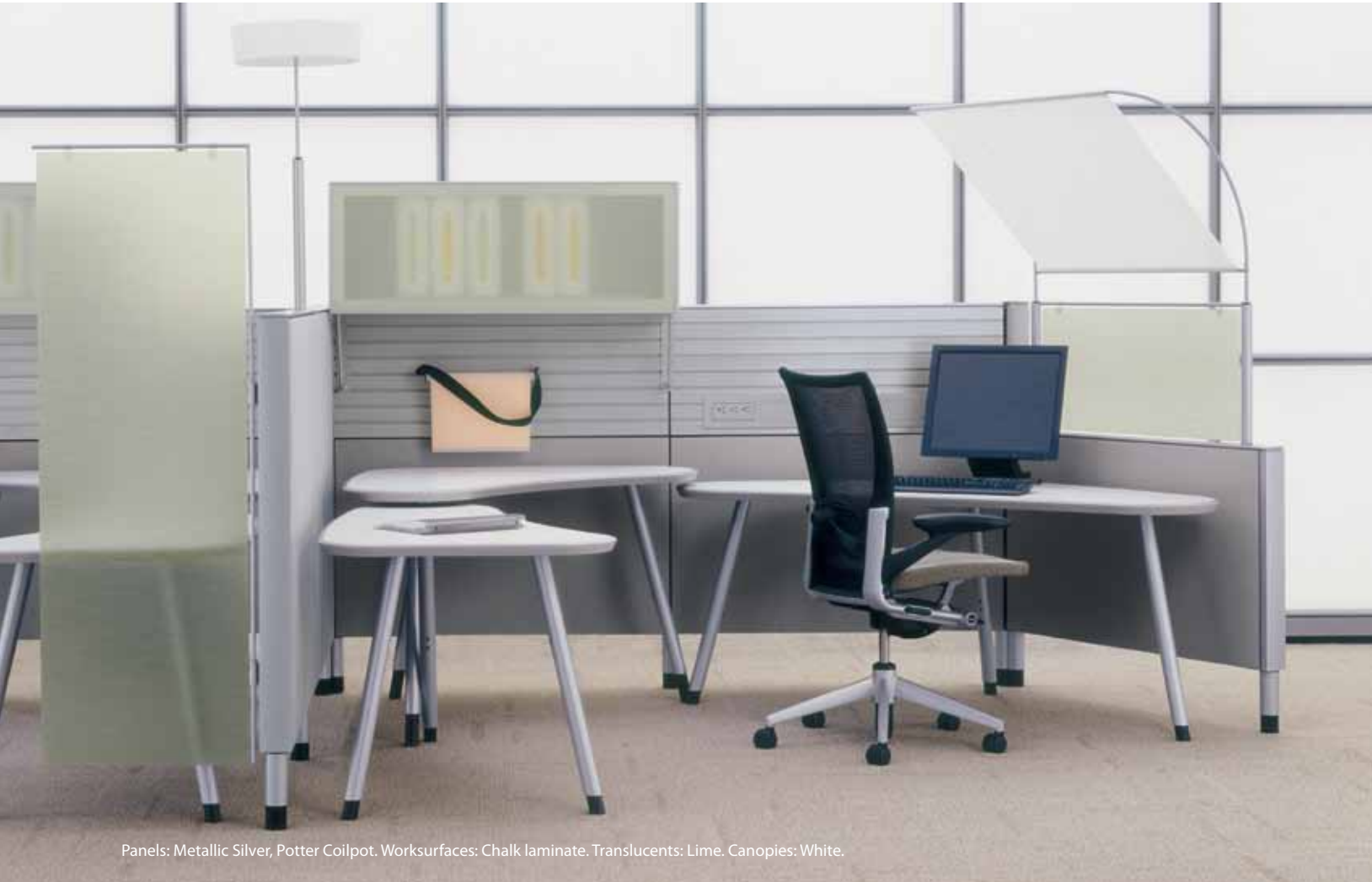
Panels: Metallic Silver, Potter Coilpot. Worksurfaces: Chalk laminate. Transluents: Lime. Canopies: White.

Combining PREMISE with distinct Moxie visual privacy elements, open-base components, and freestanding tables means reconfiguration requires minimal modification.