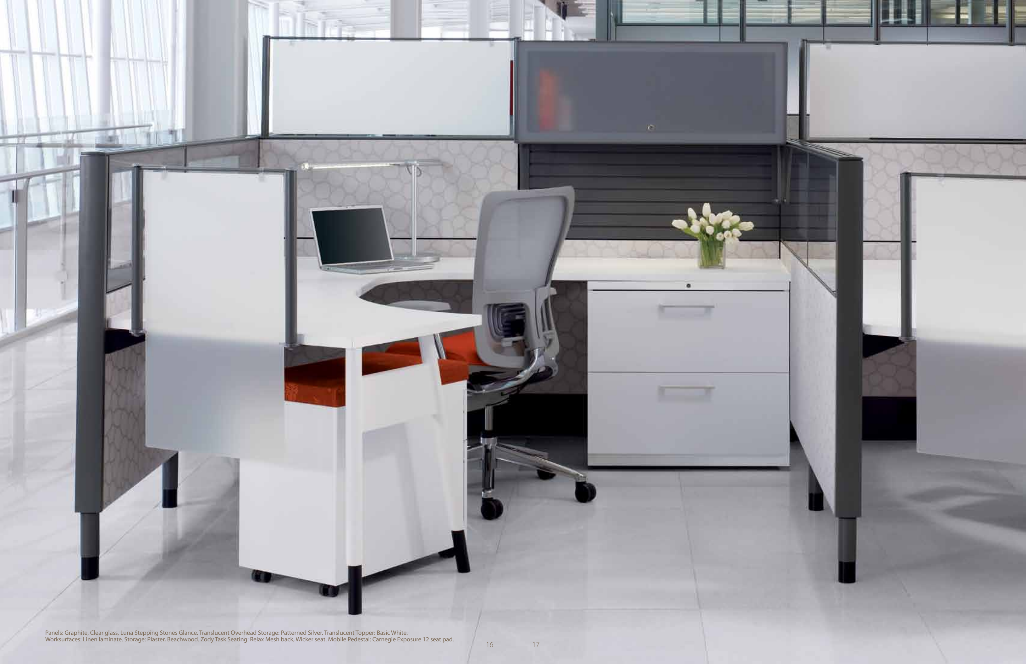
Panels: Graphite, Clear glass, Luna Stepping Stones Glance. Translucent Overhead Storage: Patterned Silver. Translucent Topper: Basic White. Worksurfaces: Linen laminate. Storage: Plaster, Beachwood. Zody Task Seating: Relax Mesh back, Wicker seat. Mobile Pedestal: Carnegie Exposure 12 seat pad.