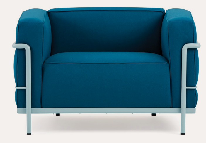
LC3 by Cassina Designed by Le Corbusier, Jeanneret, Perriand

Engage people with brands that enrich, delight, captivate, and inspire.