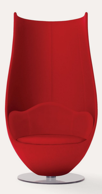
Wanders' Tulip" by Cappellini Designed by Marcel Wanders

Set the tone with high-impression spaces that convey your culture and values.