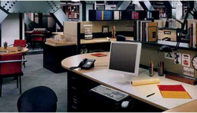
SmithGroupJJR offices before renovation.